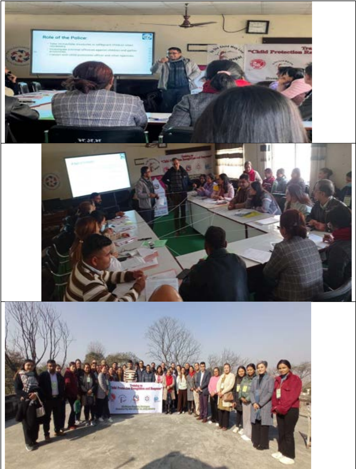
Figure no. 6 Photos of Training site Bhaktapur Hospital, Bhaktapur held on 30 Dec 2024