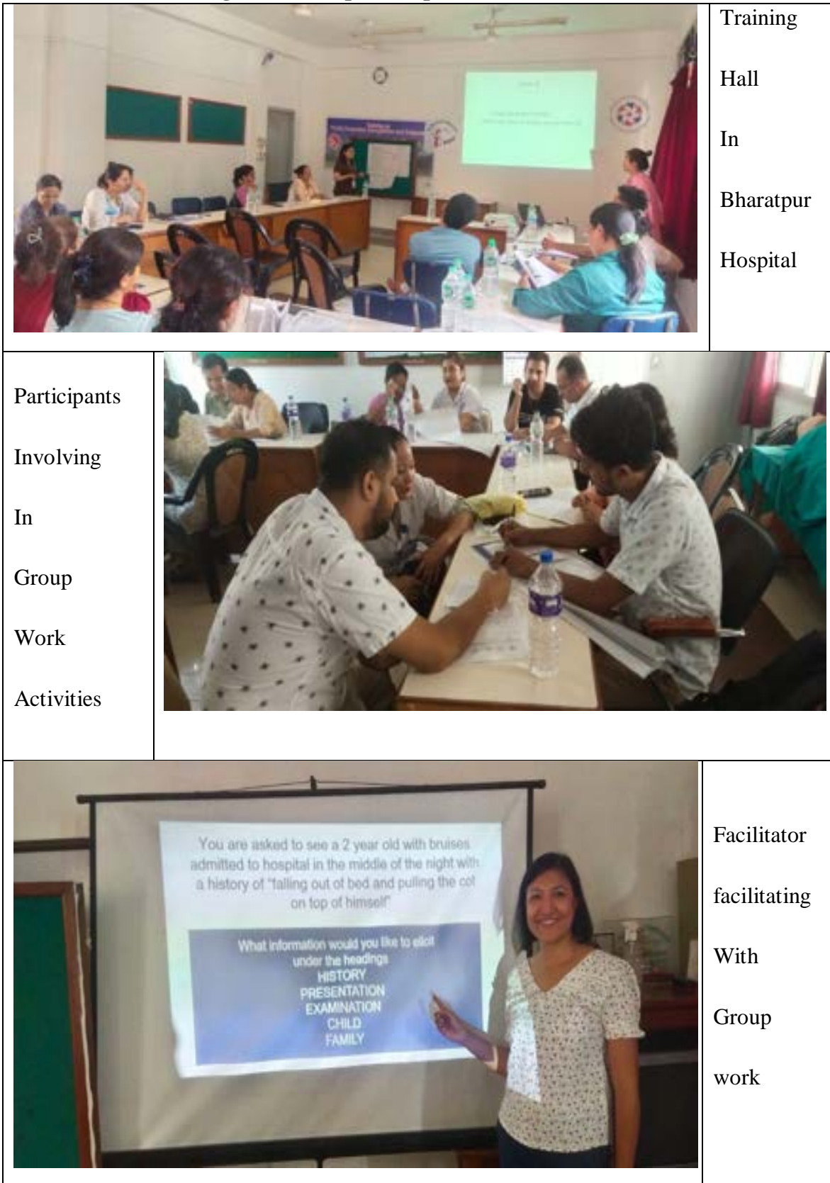
Figure No. 1 Photo of Training site Bharatpur Hospital, Chitwan