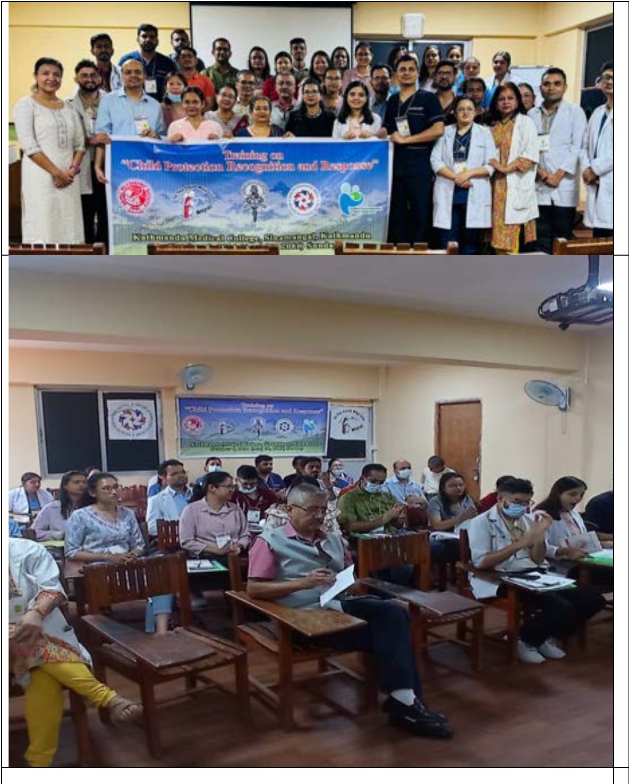
Figure no. 3 Photos of Training site Kathmandu Medical College, Kathmandu held 06 Oct 2024