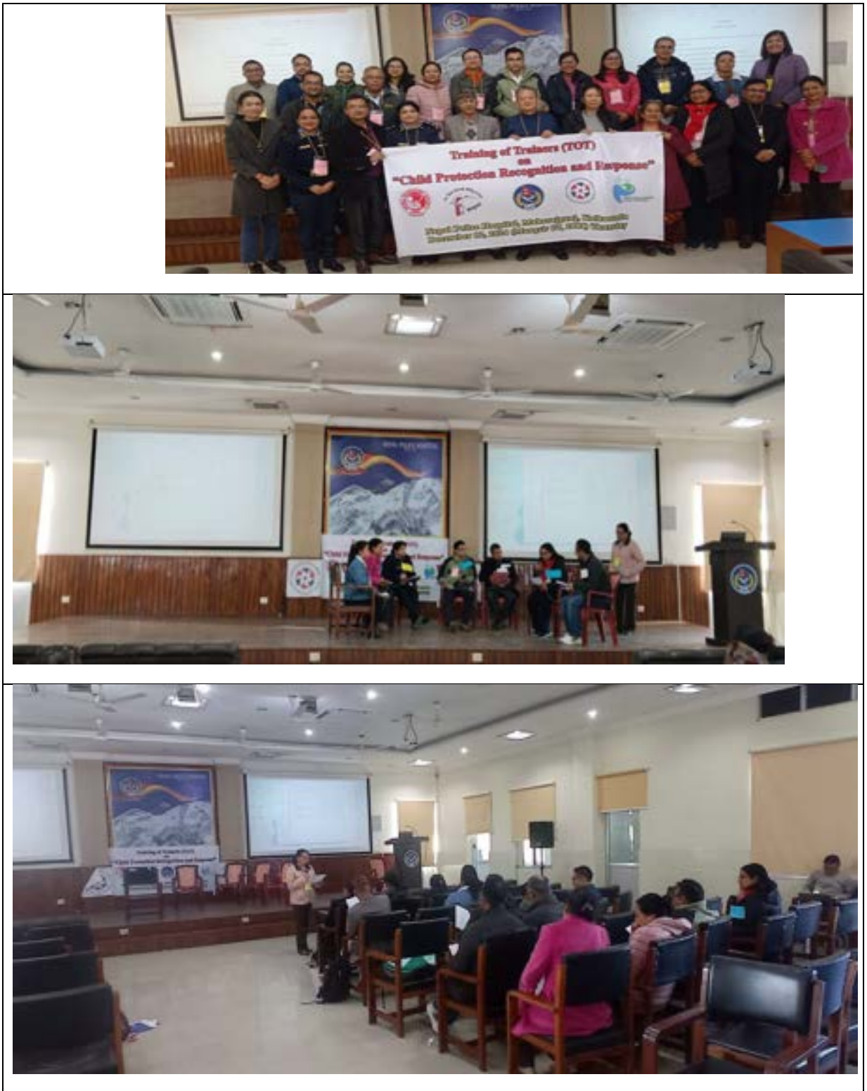
Figure no. 5 Photos of ToT from Training site Nepal Police Hospital, Kathmandu held on 12 Dec 2024