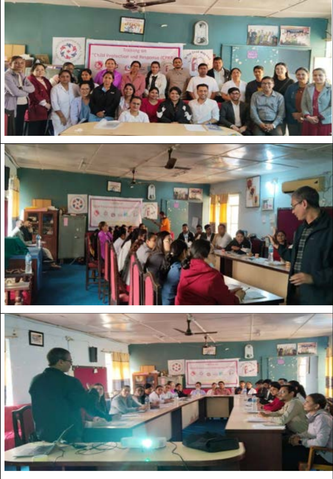
Figure 7. Photos of Training site Koshi Hospital, Biratnagar held on 27 feb 2025