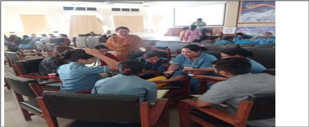
Figure no. 4 Photos of Training site Nepal Police Hospital, Kathmandu held on 07 Oct 2024