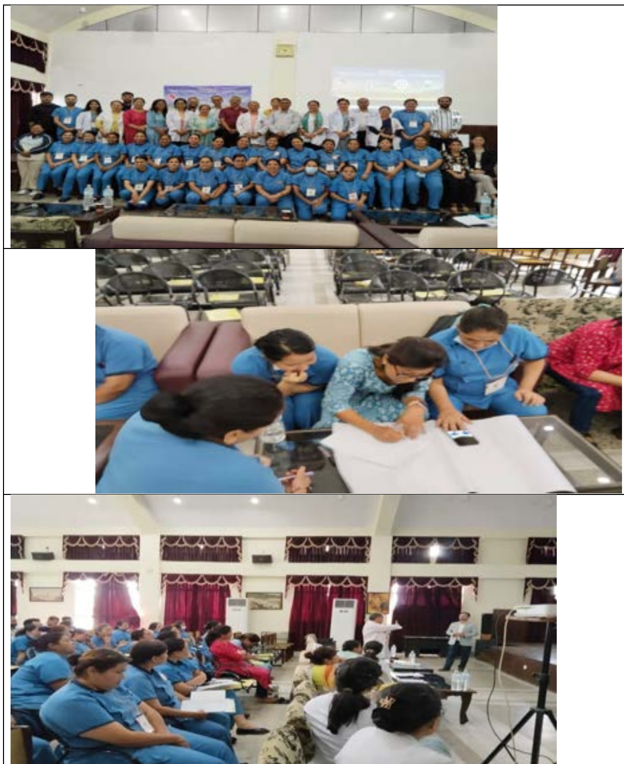
Figure no. 2 Photo of Training site Nepal Medical College, Kathmandu held on 07 Aug 2024