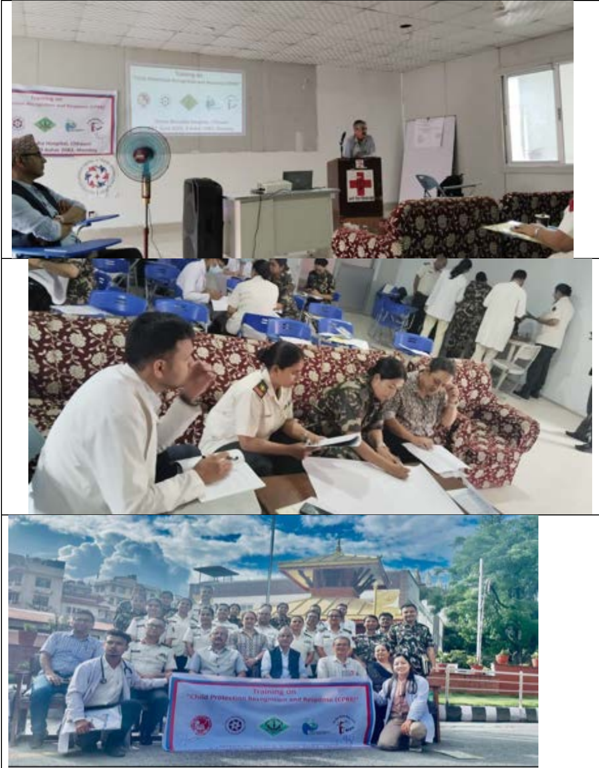
Figure 10. Photos of Training site Shree Birendra Hospital, Kathmandu held on 23 June 2025