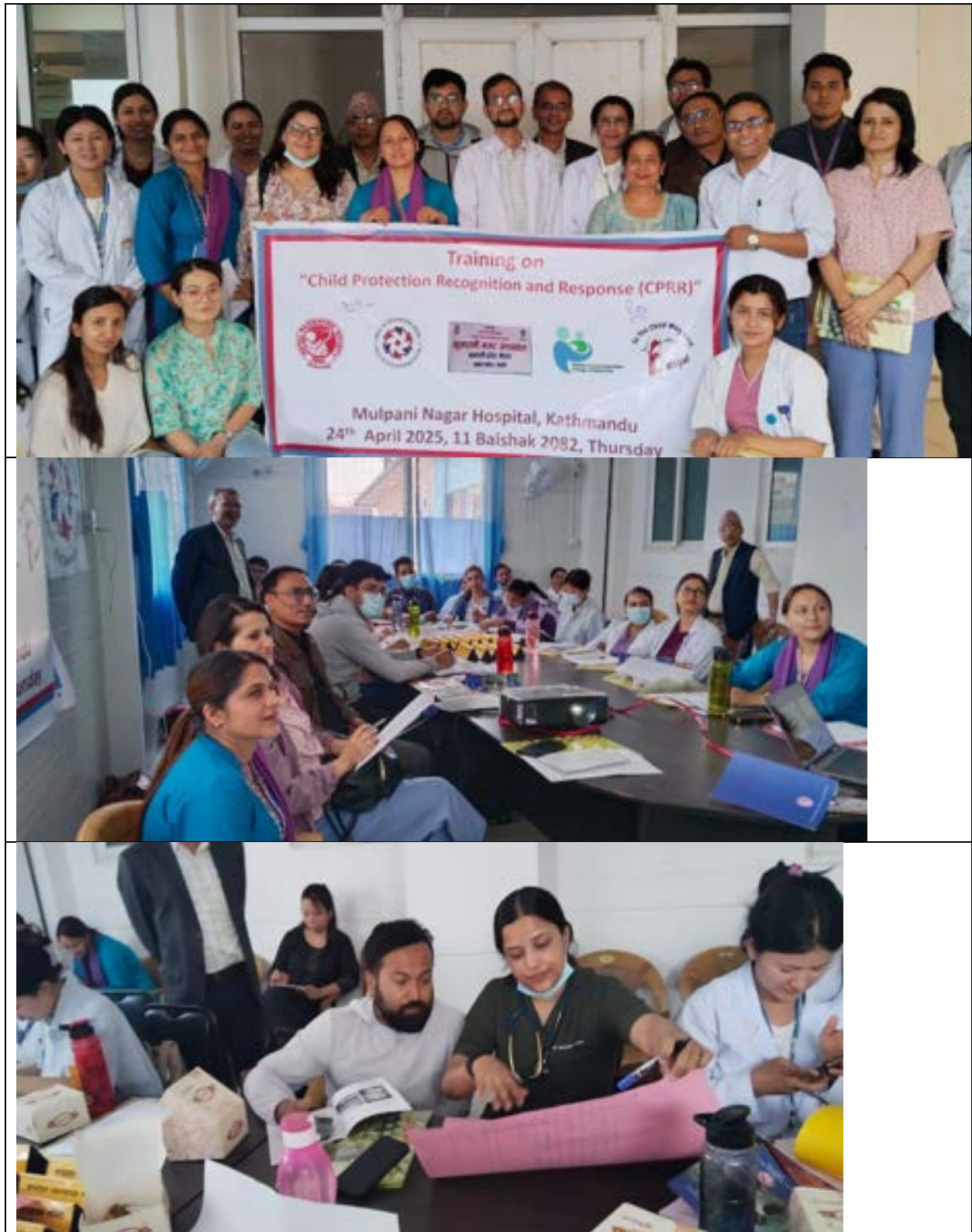
Figure no. 9 Photos of Training site Mulpani Nagar Hospital, Kathmandu held on 24 April 2025