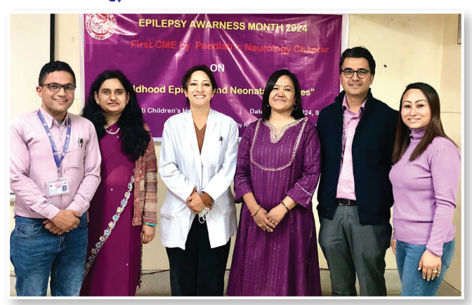
More details on www.nepas.org.np